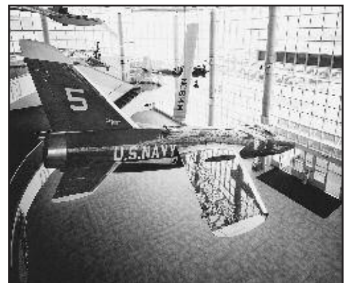
Among local tourist sites is the Cradle of Aviation Museum.