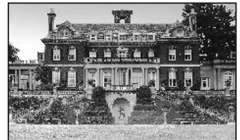
Nearby Old Westbury Gardens is one of the region's most elegant estates and is open to visitors

Continental breakfast will begin at 8:30 a.m., followed by the business portion annual meeting from 10:00 a.m. - Noon.